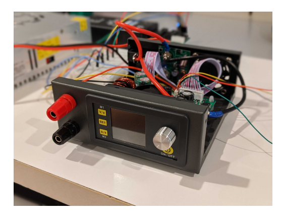
Figure 3: RD DPS5015 power supply, opened [7]

We used SHIMWARE to retrofit an RD DPS5015 [7] lab power supply unit (Figure 3).